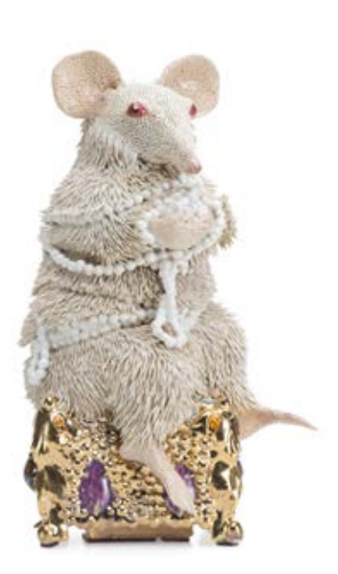
White mouse, enameled ceramic