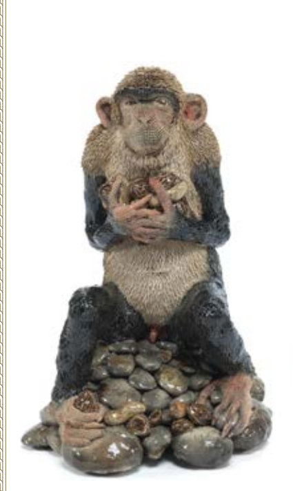
Monkey with Nuts, enameled ceramic © Winnifred Limburg — ADAGP — 2022