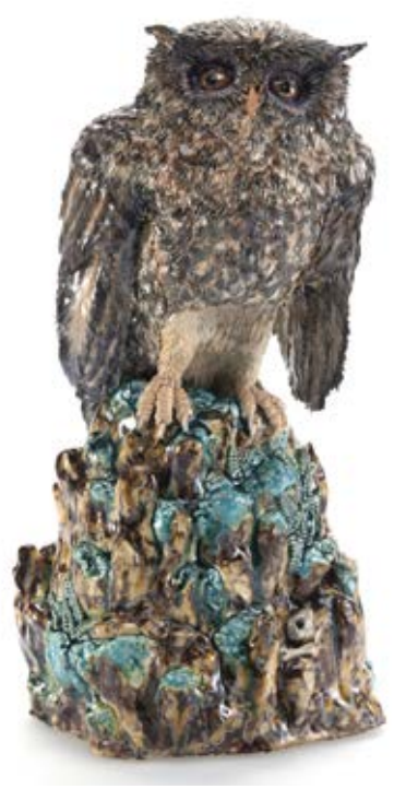
Owl on a Roch, enameled ceramic © Winnifred Limburg — ADAGP — 2022